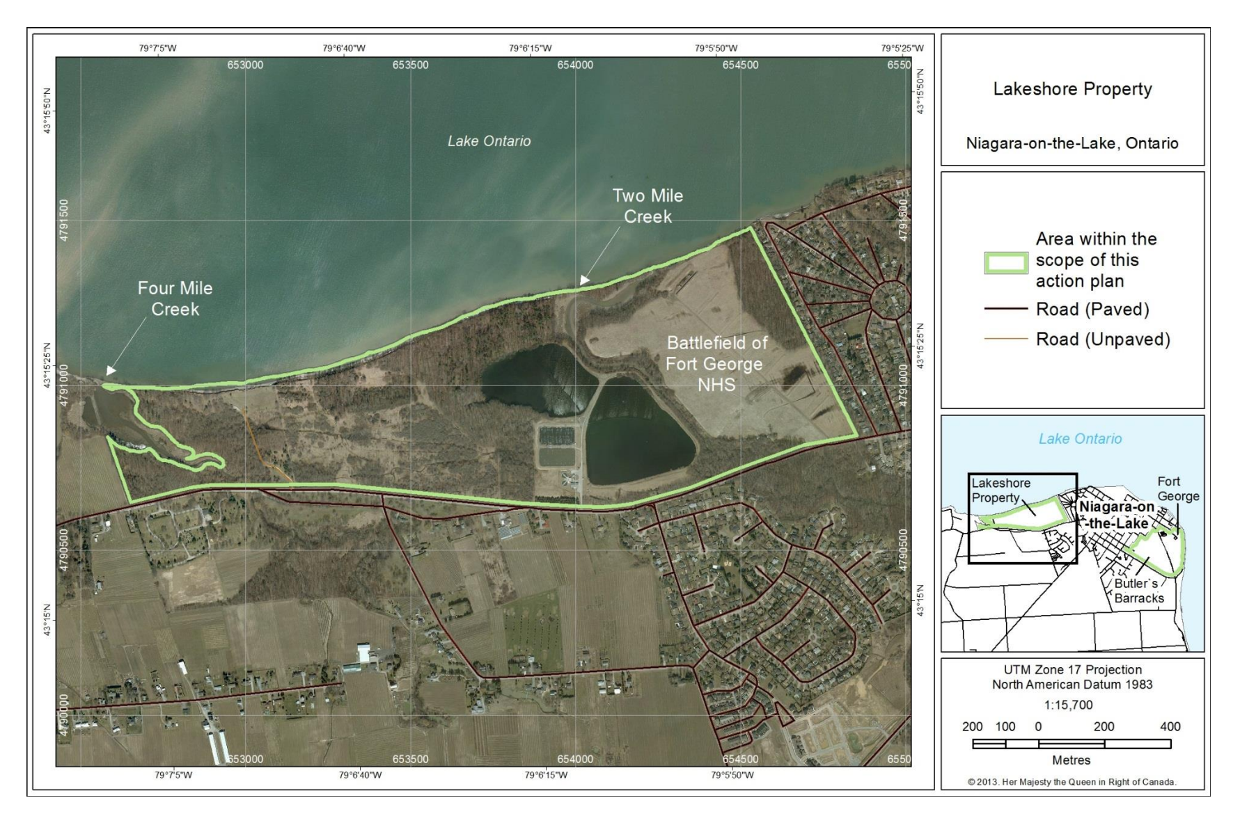
Figure 2. The Lakeshore Property included in the scope of this action plan that includes the Battlefield of Fort George National Historic Site.