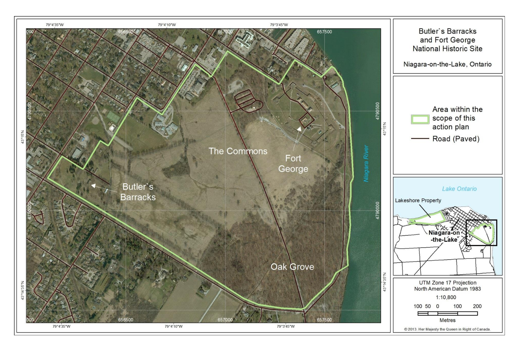
Figure 3. Fort George National Historic Site and Butler's Barracks National Historic sites included in the scope of this action plan.