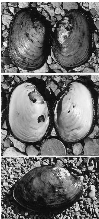
Figure 1. The yellow lampmussel, Lampsilis cariosa from Blacketts Lake, Nova Scotia. Top and middle panels show exterior and interior of female specimen, respectively, length 60 mm. Bottom panel shows live male specimen, length 75 mm (from COSEWIC, 2004, courtesy of D. Davis).

The inside of the shell (nacre) is white. The soft living parts (mantle) are visible along the shell margins. The mantle edge is smooth with grey streaks or dots and has a well developed, brightly pigmented flap-like extension and a dark eyespot. These characteristics are best developed in the female. A more technical description of the YLM can be found in COSEWIC (2004).