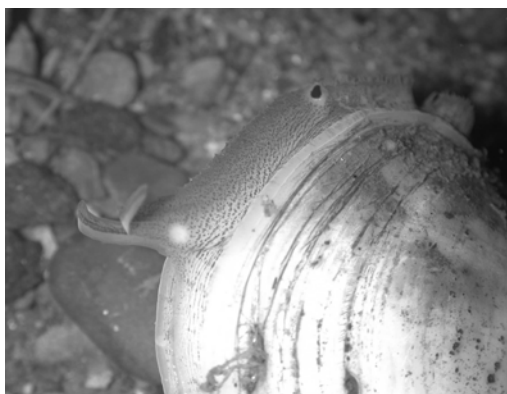
Figure 5: Minnow-like mantle lure of female Lampsilis cariosa from Blacketts Lake, NS (photo courtesy of K. White).

White perch ( Morone americana ) is known to be a host fish for the YLM in the Sydney River (White 2003). Banded killifish ( Fundulus diaphanous ) may also be a host species in this system (K. White, CBU, per. comm. 2007). Fish host species in the Saint John River have not been confirmed, but based on research in the US (Wick and Huryn 2002, 2003), and known fish species in the Saint John River, they are thought to be white perch and/or yellow perch ( Perca flavescens ) (Sabine et al. 2004). The YLM is not likely dependant on a single species of host fish to reproduce successfully; further research should test whether a limited diversity of fish species serve as their hosts in Canada.