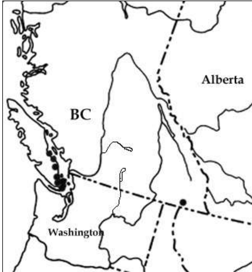
Figure 3. Canadian distribution of banded cord-moss (dots may represent more than one occurrence; see Table 1 for details).