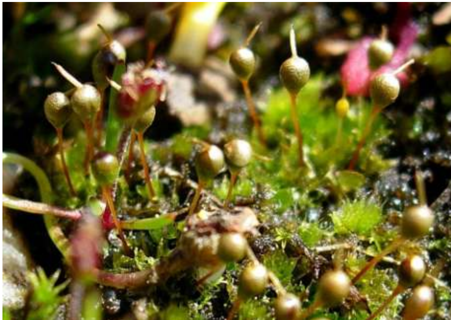
Figure 1. Patch of banded cord-moss showing plants and young sporophytes (note the long-tipped calyptrae covering the maturing capsules; ~ x 15).

Banded cord-moss can be easily be misidentified as common cord-moss ( Physcomitrium pyriforme ), which is similar in morphology and also grows on soil in open habitats in coastal British Columbia. However, the top of the operculum of banded cord-moss is rounded and usually smooth, although it sometimes has a small, rounded bump when young, whereas the operculum of common cord-moss always has a short beak or pointed bump on top. Also, common cord-moss usually occupies more heavily disturbed areas than banded cord-moss and can form much larger patches in most cases.