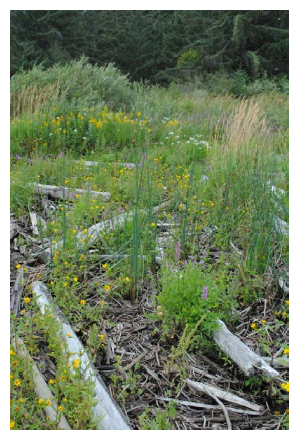
Figure 5. Vancouver Island beggarticks habitat.