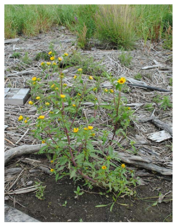
Figure 1. Vancouver Island beggarticks at Somass River Delta.

This species shares traits and appears to readily hybridize with two closely related species, nodding beggarticks ( Bidens cernua ) and European beggarticks ( Bidens tripartita ), but is readily distinguished based on seed and flower head characteristics.