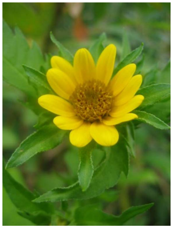
Figure 2. Vancouver Island beggarticks flower.