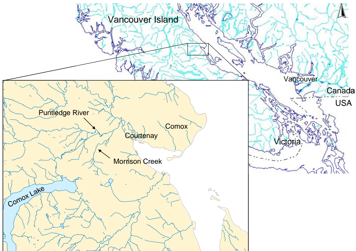
Figure 3. Distribution of Morrison Creek lamprey. (Map base obtained from Ministry of Energy, Mines and Petroleum Resources, http://www.em.gov.bc.ca/mining/Geolsurv/MapPlace/themeMaps.htm ).