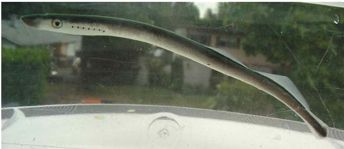
Figure 1. Photograph of Morrison Creek lamprey, taken in spring 2005. This specimen is ~ 12 cm total length, and is thought to be 3 to 4 months post metamorphosis.

In British Columbia there are 4 described species of lamprey (Beamish 1985). Lampetra richardsoni is a non-anadromous, non-parasitic, freshwater-resident species commonly found in streams. The Pacific Lamprey, L. tridentata , is anadromous and parasitic; it is commonly found in coastal streams and marine coastal areas. L. ayresi is anadromous and parasitic. It can be very abundant in the Fraser River, and is common in the Strait of Georgia during its parasitic phase. Little research has been done on this species outside the Georgia Basin. L. macrostoma , originally described by Beamish (1982), is parasitic and assumed to be derived from L. tridentata . It has been reported only in Cowichan and Mesachie lakes (Beamish 1998).