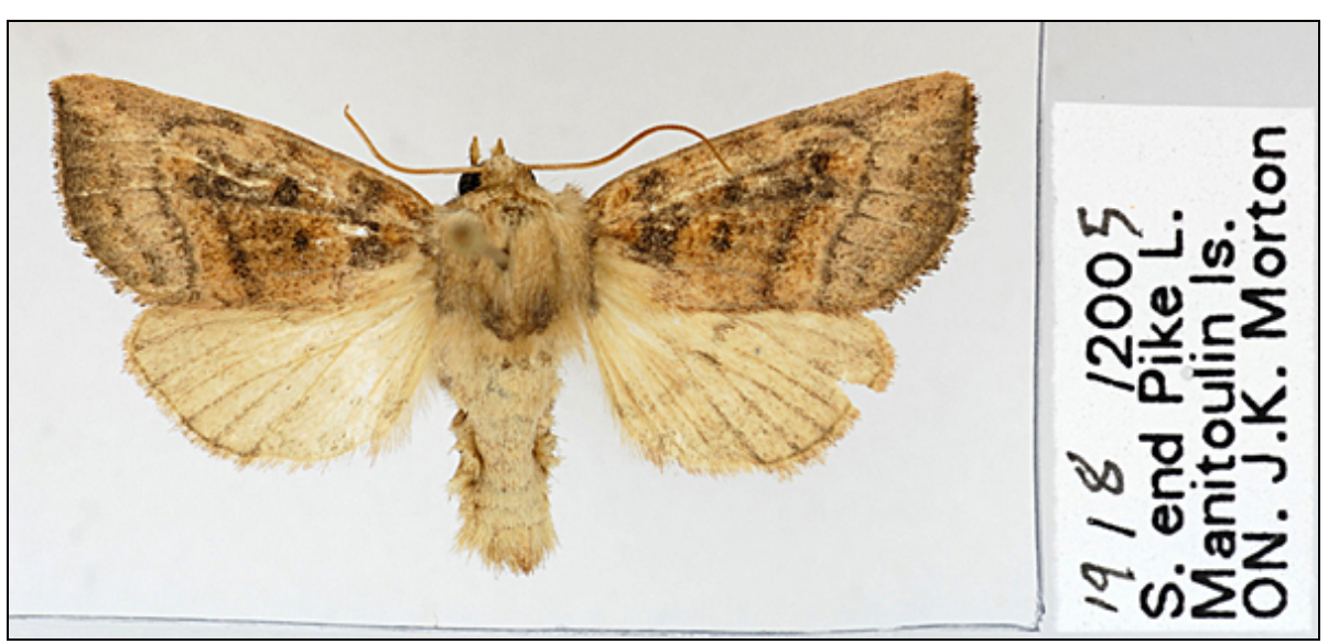
Figure 1. The Aweme Borer collected on Manitoulin Island.

Quinter 2003). As well, the Aweme Borer is not listed in most popular field guides due to its rarity. Compared to other species in this genus, the adult Aweme Borer is a rather small, very pale, plain, light brown moth. Any moth suspected to be the Aweme Borer should be confirmed by an expert.