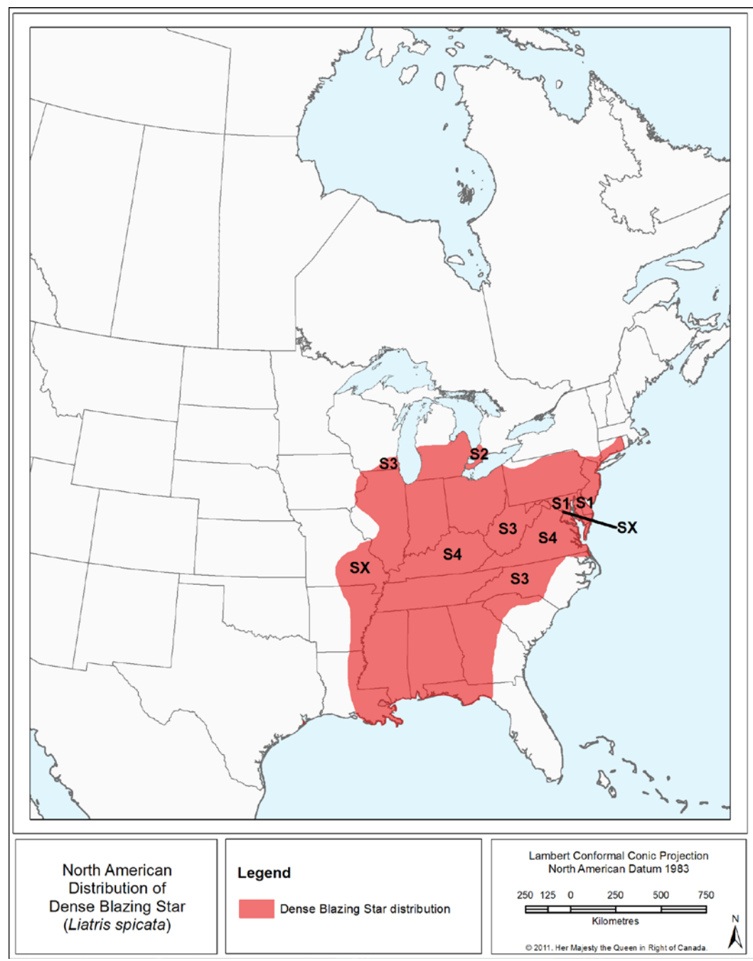
Figure 1. North American Distribution of Dense Blazing Star (range distribution based on Royal Ontario Museum (2011), and subnational (state or province) status ranks based on NatureServe (2011)).