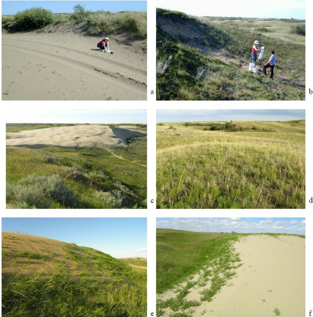
Figure 4. Sand dune habitat characteristics: a) human-made fireguard with open sand in which Dusky Dune Moth ( Copablepharon longipenne ) was abundant (Dundurn SH); b) semi-stabilized dune blowout in which Dusky Dune Moth was not captured (Dundurn SH); c) dune margin with high abundance of Dusky Dune Moth (Seward SH); d) dry grassland near open dune in which Dusky Dune Moth was not captured (Great SH); e) active dune complex with Lance-Leaved Scurf-pea and Canada Wildrye on the slip face (Cramersburg SH; Dusky Dune Moth was captured); and f) sparsely vegetated margin of active dune in Burstall SH with Lance-leaved Scurf-pea and Sand Dock colonization (not sampled in 2004–2005 but Dusky Dune Moth found several times previously). (a, b: August 2004; c–f: July 2005) (COSEWIC 2007).