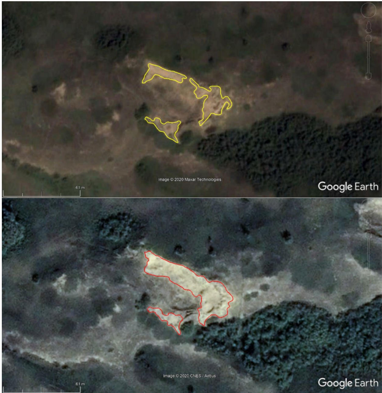
Figure 6. Comparison of 2012 (upper) and 2019 (lower) satellite images of blowout #339 (Wolfe 2010) in the Cramersburg Sand Hills where Dusky Dune Moth has been observed (Curteanu et al. 2011). Red and yellow outlines delimit the approximate edge of the open dune in 2012 and 2019 respectively, showing the increase in open active sand area.