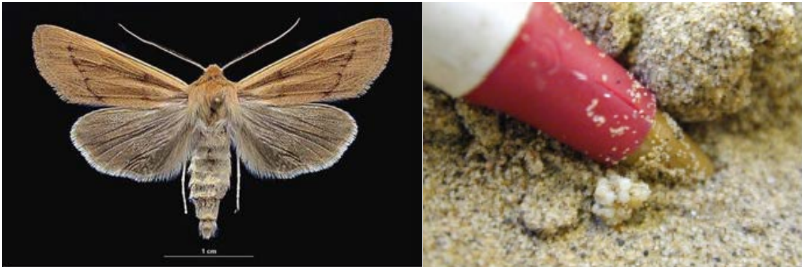
Figure 1. Adult male Dusky Dune Moth ( Copablepharon longipenne ) from the E.H. Strickland Entomological Museum (2020) left, and egg mass excavated from open sand in the Seward Sand Hills, right (August 5, 2004).

Dusky Dune Moth is a medium-sized, light brown moth with a distinctive line of black dots on the forewing (Figure 1). Adults are sexually dimorphic in size: forewing length in the Canadian subspecies of Dusky Dune Moth averages 15.4 mm (range 11–18 mm) in males and 18.6 mm (range 17–20 mm) in females (Lafontaine et al. 2004). A pale streak is often present along the edge of the forewing or between the cubital and anal veins (Lafontaine et al. 2004). A series of uniformly sized black dots mark each wing vein at the postmedial line. The hindwing is entirely dark fuscous. The fringe is dark brown basally and white outwardly. The head, thorax, and abdomen are light brown. Males have narrowly bipectinate antennae (about 2.5 times as long as wide), whereas female antennae are filiform (Lafontaine et al. 2004).