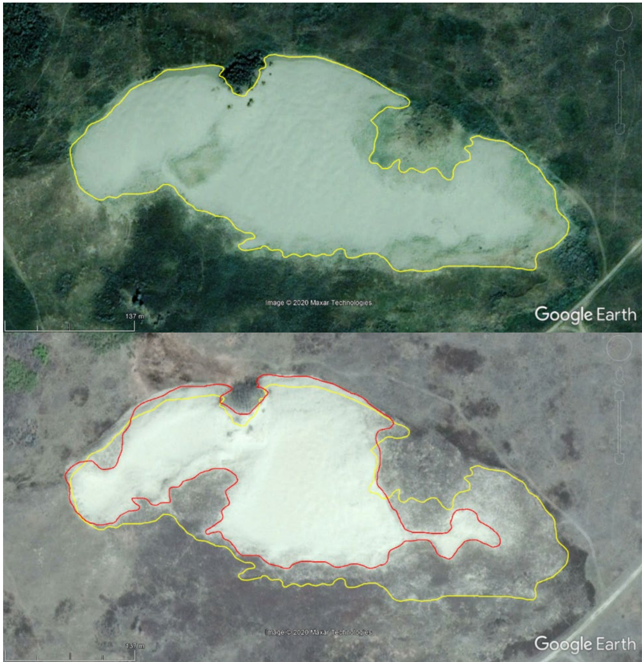
Figure 5. Comparison of 2007 (upper) and 2015 (lower) satellite images of open dune #749 (Wolfe 2010) in the Seward Sand Hills where Dusky Dune Moth was abundant in 2004 (COSEWIC 2007). Red and yellow outlines delimit the approximate edge of the open dune in 2007 and 2015 respectively, showing the decrease in open active sand area.