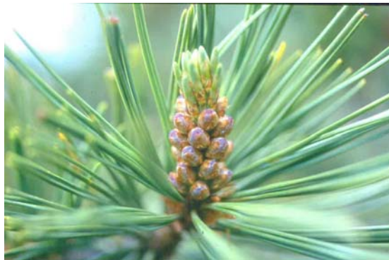
Figure 1. Whitebark Pine cones: seed cone (a) and cluster of pollen cones (b).

Whitebark Pine can be confused with Limber Pine ( P. flexilis ) where the ranges of two species overlap in southwestern Alberta and southeastern British Columbia. Both species have five needles, often grow on rocky, exposed sites, and can have a similar canopy shape. Seed cones of Limber Pine are typically longer (7-15 cm vs. 5-8 cm for Whitebark Pine), are tan coloured vs. brown to purple, open to release the seeds and then drop from the tree vs. closed cones that remain on the tree unless removed by animals. The presence of cones on the ground beneath a tree is often the clearest evidence of Limber Pine. The pollen cones of Limber Pine are typically yellowish vs. scarlet for Whitebark Pine.