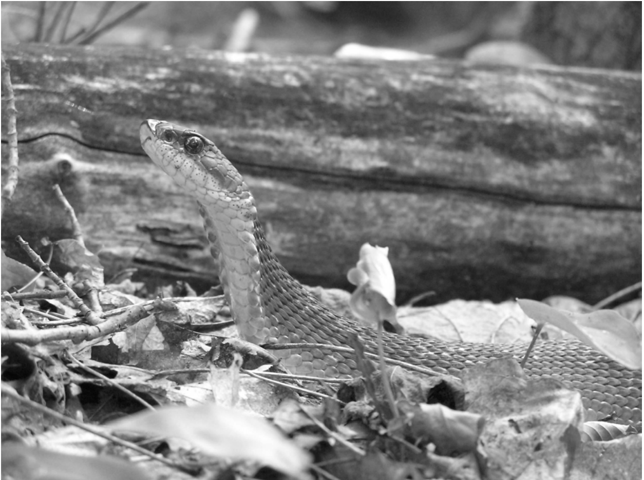
Figure 1: Photo of Eastern Hog-nosed Snake